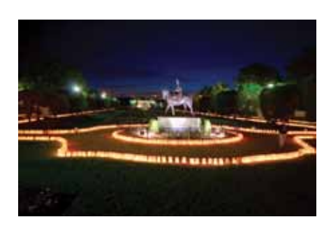
The luminary display at the Canadian Cancer Society Relay for Life.