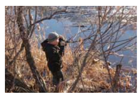
Wascana Junior Naturalists bird watching.