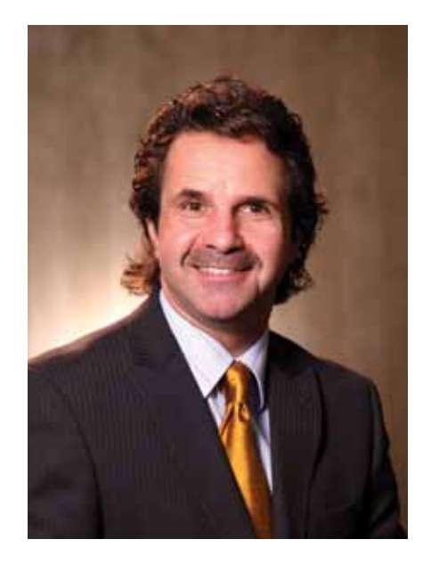
Wascana Centre truly is the jewel in Regina's crown and enjoyed by so many.

I also extend my appreciation to the Board of Directors for their dedication and contributions to Wascana Centre Authority. Your time and expertise provide valuable guidance to the operation of the Centre.