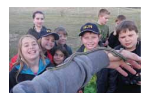
Wascana Junior Naturalists checking out a garter snake.